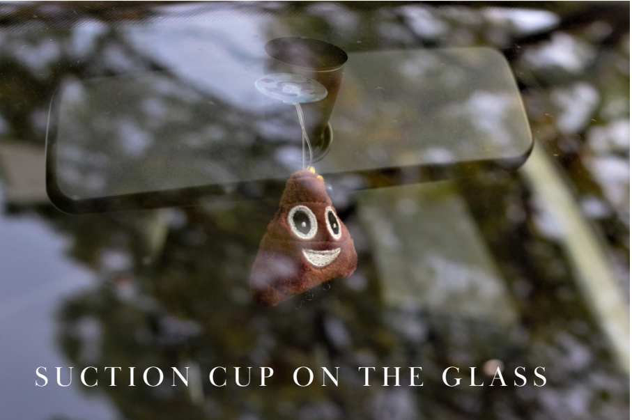
SUCTION CUP ON THE GLASS